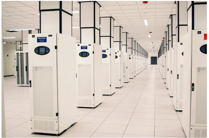
Confidential Tier III Data Center for Fortune 100 Company