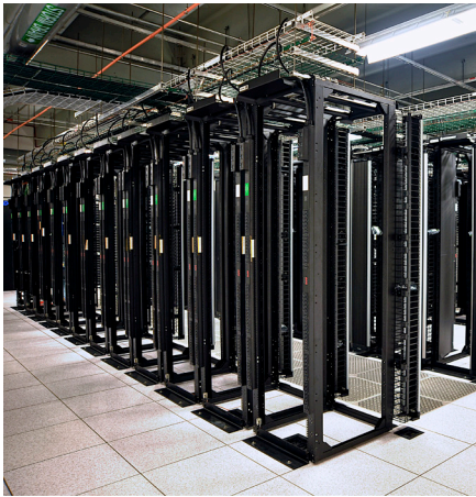
Confidential Financial Client Data Center