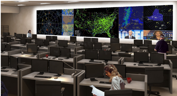
Confidential Tier III Data Center for Fortune 100 Company