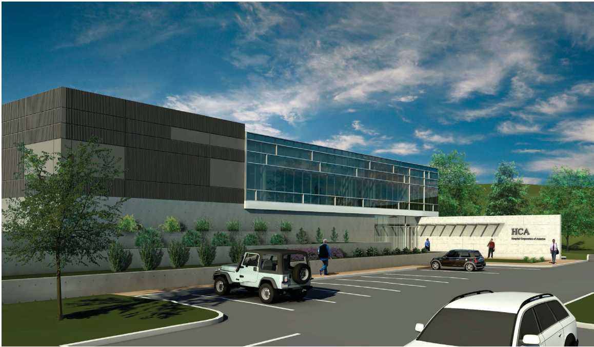
Hospital Corporation of America

With over a century of professional design experience around the globe, Page possesses a comprehensive understanding of the specialized qualities of exemplary design that result in safe, reliable, sustainable and attractive facilities for today that remain relevant tomorrow.