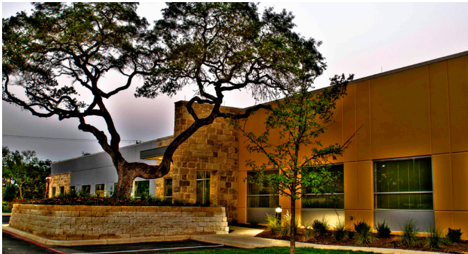
Frost Bank Data Center